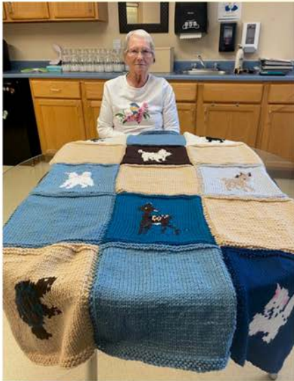
Gay's knitted baby blanket