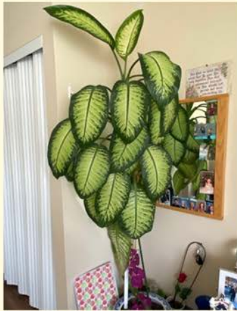
Heidi's Tissue holder (top) and Tropic Snow Dumb Cane ( Dieffenbachia seguine ) (left)